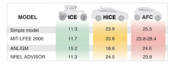
Fig. 2. Comparison of WTW energy efficiencies of advanced vehicle systems using gasoline fuel. Color coding follows that in Fig. 1. 90% WTT efficiency in all cases; thus WTW = 0.90 TTW. Data for ICE and HICE is from (7), table 5.3. Data for AFC is from (8), which does not give energy efficiency directly. We derive a range for energy efficiency by comparing data in tables 8 and 9 for MJ/km for vehicle and fuel cycle for the 2020 ICE hybrid to that of the gasoline FC hybrid given in (7), table 5.3. Data from (6), table 2.1. Data from NREL's ADVISOR simulation; for details, see Table 1.

Our analysis shows that hybrids offer the potential for tremendous improvement in energy use and significant reduction in carbon emissions compared to current ICE technology. But hybrid vehicles will only be adopted in significant quantities if the cost to the consumer is comparable to the conventional ICE alternative. Hybrid technology is here today, but, of course, hybrid vehicles cost more than equivalent ICE vehicles because of the parallel drive train. Estimates of the cost differential vary, but a range of $1000 to $2000 is not unreasonable. Depending on the miles driven, the cost of ownership of a hybrid vehicle may be lower than a conventional ICE, because the discounted value of the fuel saving is greater than the incremental capital cost for the parallel drive train and